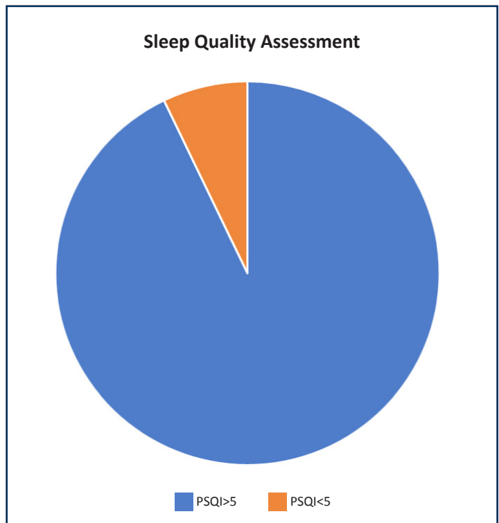
Figure 3. Diagnosed Sleep Disorders After Traumatic Brain Injury

Of these participants, 50 percent took 16-30 minutes to fall asleep, 28.57 percent had trouble sleeping because they could not get to sleep within 30 minutes, 28.57 percent complained of waking up in the middle of the night or early morning, 42.86 percent had trouble breathing at least once a week, 42.86 percent had trouble sleeping because of snoring loudly once or twice a